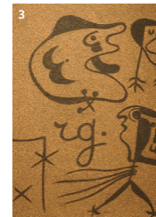
Joan Miró, Spanish Signs and Figurations , 1936 20th and 21st Century Art