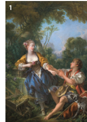
François Boucher, French The Bird Has Flown , 1765 European: 18th Century Art