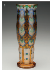
Glasfachschule Haida & Johann Oertel & Co. (Haida, Czech Republic) Vase, ca. 1915 - 1920 Ashbaugh Decorative Arts Gallery