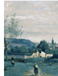
Jean Baptiste Camille Corot, French Landscape at Limay , ca. 1850-1870 European: 19th Century Art