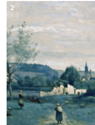
2 Jean Baptiste Camille Corot, French Landscape at Limay , ca. 1850-1870 European: 19th Century Art