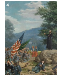
4 Paul Henry Wood, American Absolution Under Fire , 1891 American Art