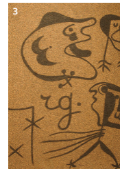
3 Joan Miró, Spanish Signs and Figurations , 1936 20th and 21st Century Art