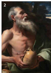
2 Jusepe de Ribera Spanish (active Italy), 1591-1652 St. Paul the Hermit , 1610-11 European: 16th & 17th Century Art