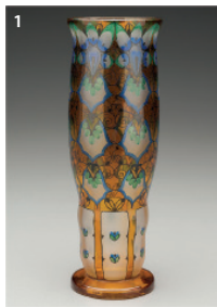
1 Glasfachschnle Haida & Johann Oertel & Co. (Haida, Czech Republic) Vase, ca. 1915 - 1920 Ashbaugh Decorative Arts Gallery