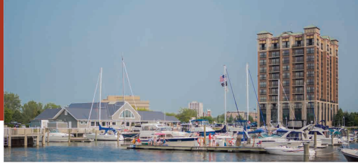
Lakehouse Waterfront Grille in Muskegon

The Notre Dame Office of Risk Management requires that the Museum obtain each participant's signature on a release form prior to departure. This form will be mailed along with the campus parking map and permit upon receipt of completed registration form and payment.