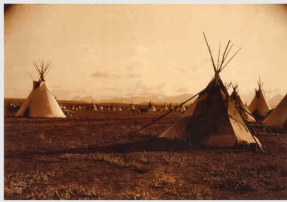
Piegian Encampment, c1900

image on cover: Zuni Governor, Edward Curtis, 1905