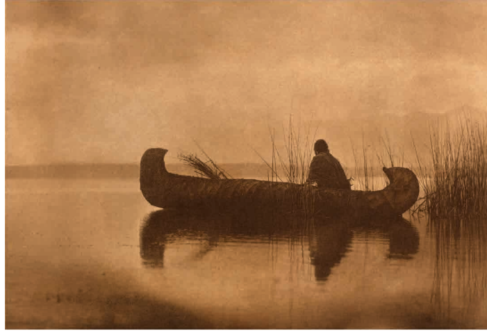
Kutenai Duck Hunter, c1910