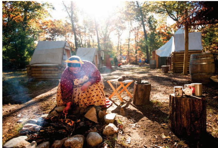
Michigan Heritage Center (above)